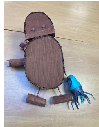
Pooper Scooper Activator