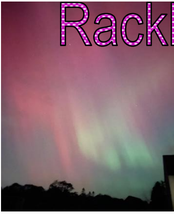
Aurora over Rackheath last night